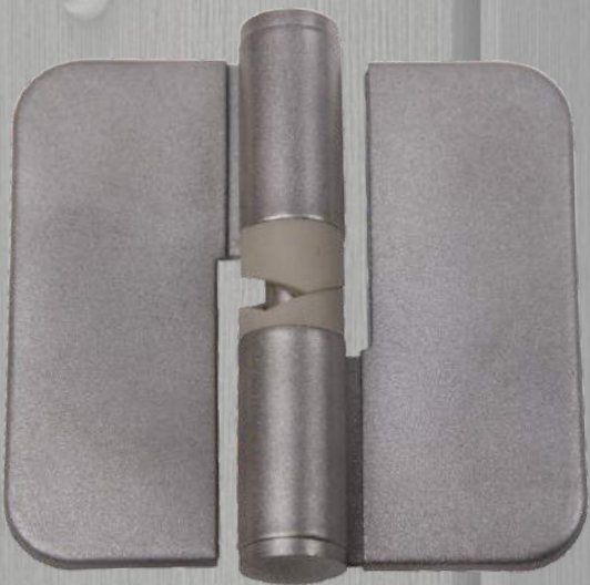
Sentinel Authentic Industrial Stainless Steel Finish