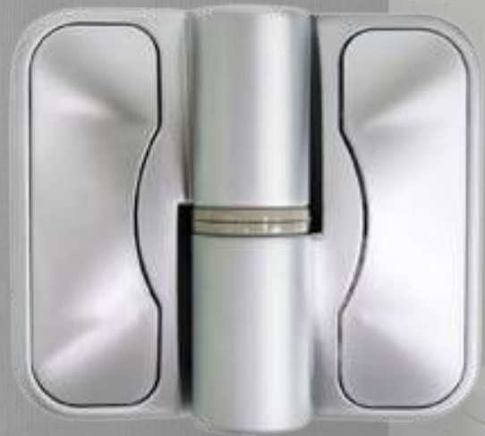
Satin Chrome Plate Finish (SCP)

Note: Not all Metlam Australia Toilet Partition Hardware (TPH) is available in all finishes listed above. Visit our website for further details on TPH products and available finishes.