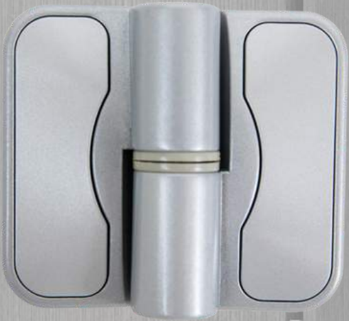
Antimicrobial Finish (ANMB)