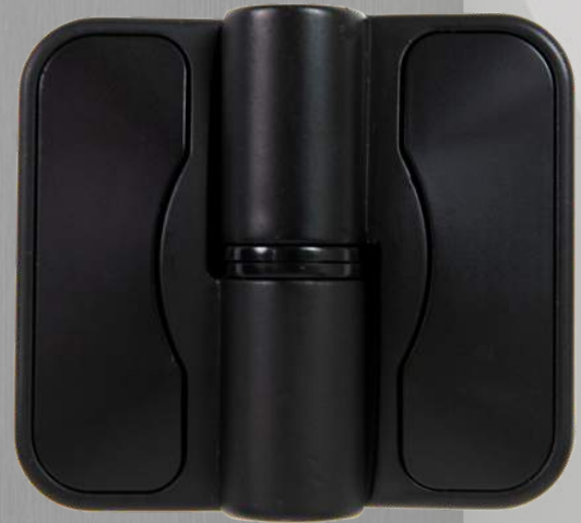
Satin Matte Black (DESIGNER)